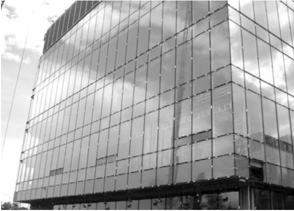
Exterior of TOHCC construction, June 2009

The expansion of The Ottawa Hospital Cancer Centre – the largest in the Centre’s history – remains on track for its scheduled opening in January 2010. As of July 2009, our community had donated more than $14.1 million for this crucial campaign. For more information on the 20-20 Campaign, visit www.ohfoundation.ca .