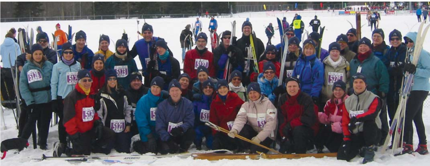
A cold February 18 was no deterrent for 54 skiers who raised $20,000 for the Little Angels Bone Marrow Transplant Fund during the Keskinada Loppet ski race held in Gatineau Park. The fund assists cancer patients undergoing transplant treatments by helping cover transportation, child care, lodging and other expenses incurred by them and their families.