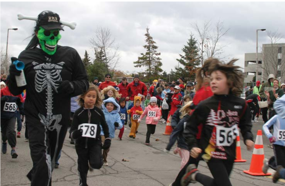
Rattle Me Bones, presented by Schering Canada, raised $70,000 for patient care, and arthritis and orthopedic research in 2006. A record 1,500 participants—including this ragtag group of ghouls—helped make this road race our best year ever.