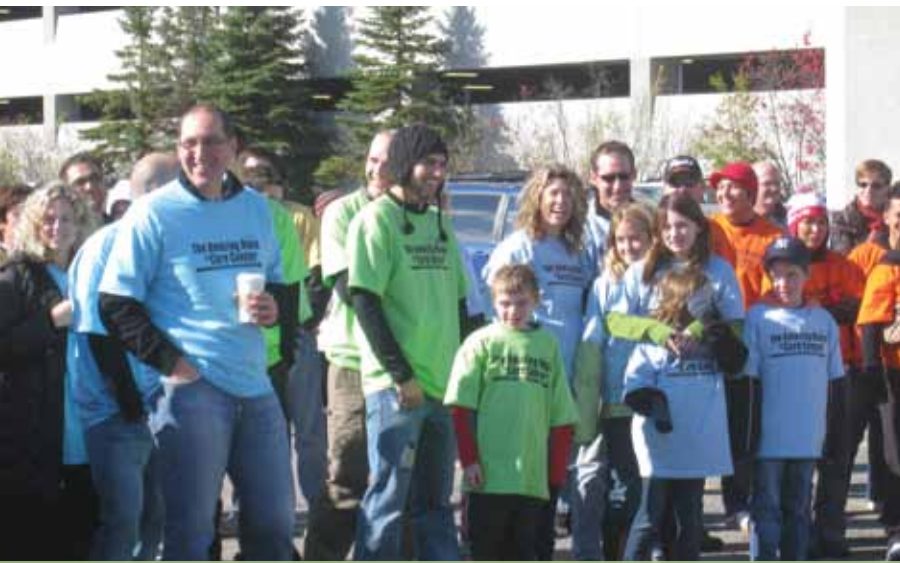
Left: Thermo Fisher Scientific employees and their families and friends participate in The Amazing Race to Cure Cancer in support of the Centre for Innovative Cancer Research. Below: Representatives from workplaces, such as GasTOPS, Iogen and CGI, tour the Centre for Innovative Cancer Research to witness their fundraising efforts at work.